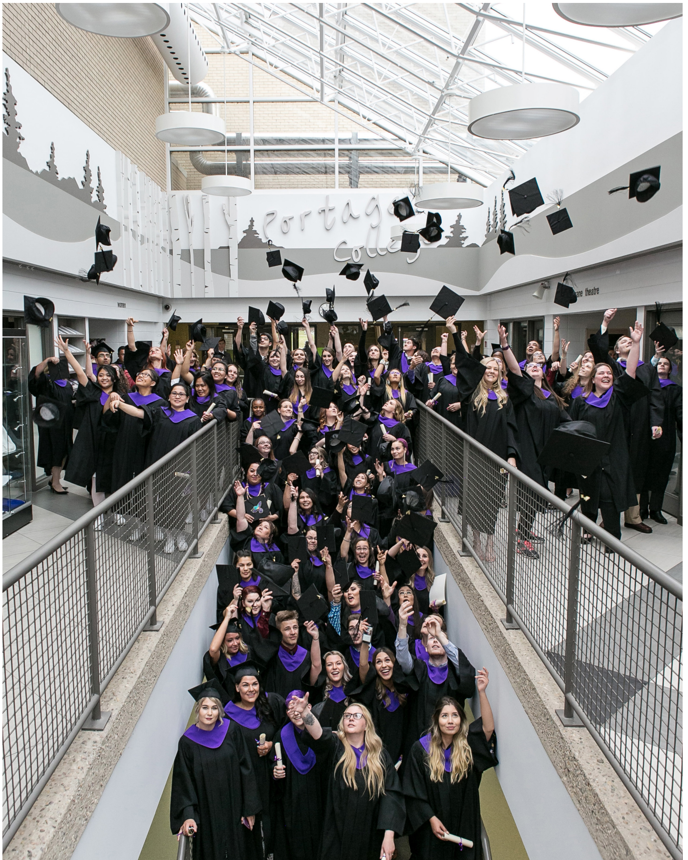
Cap Toss, Convocation 2018