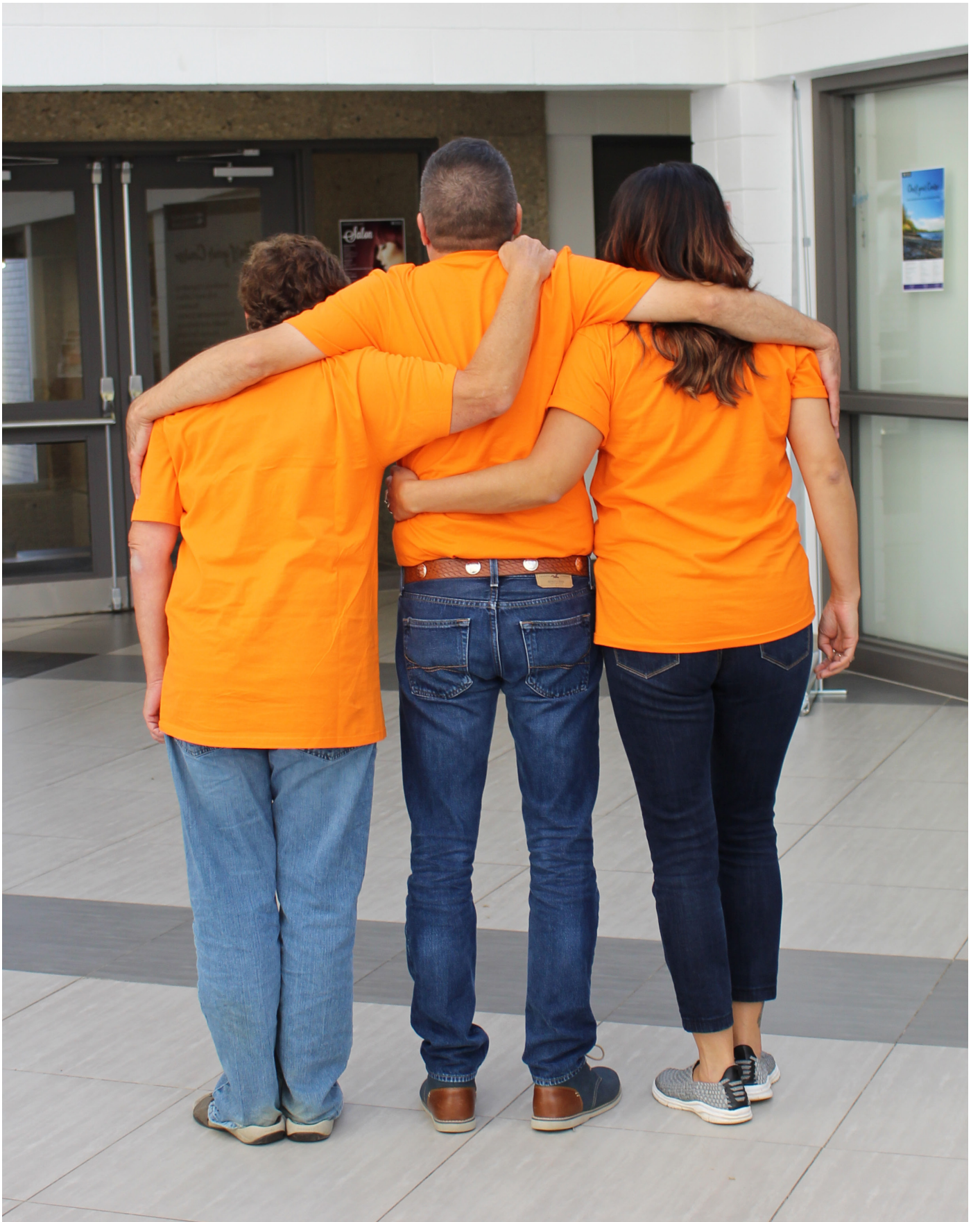
Orange Shirt Day, September 30, 2017