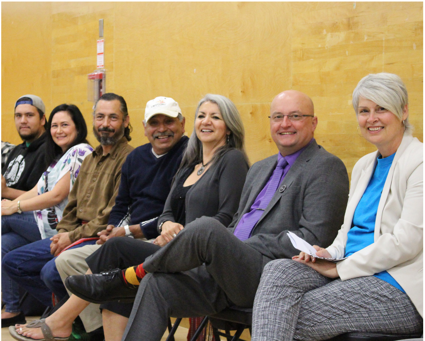
Orientation, August 2017