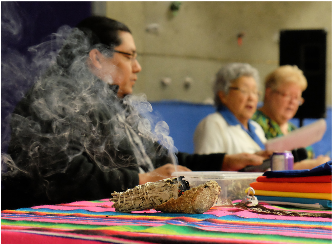
Round Dance, 2018

The College examined the feasibility of joining a metasearch engine that would allow students from anywhere in the world to find out about Portage College and our program offerings. The cost was prohibitive, however, and the College determined it was not worth the return on investment.