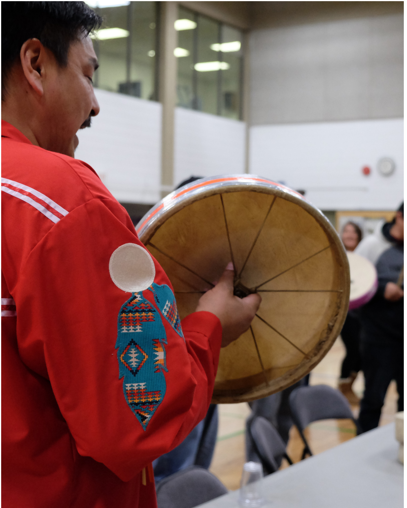
Round Dance, 2018