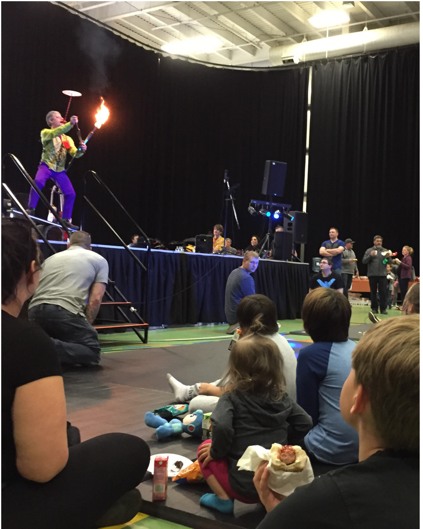
Portage College-sponsored Kids Carnival in Cold Lake, May 2018