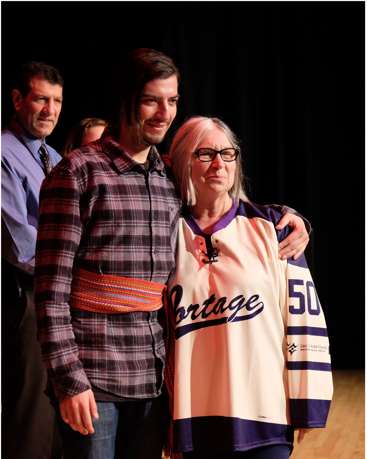
Rupertsland Metis Scholar Awards given to 27 Portage College students, February 23, 2018