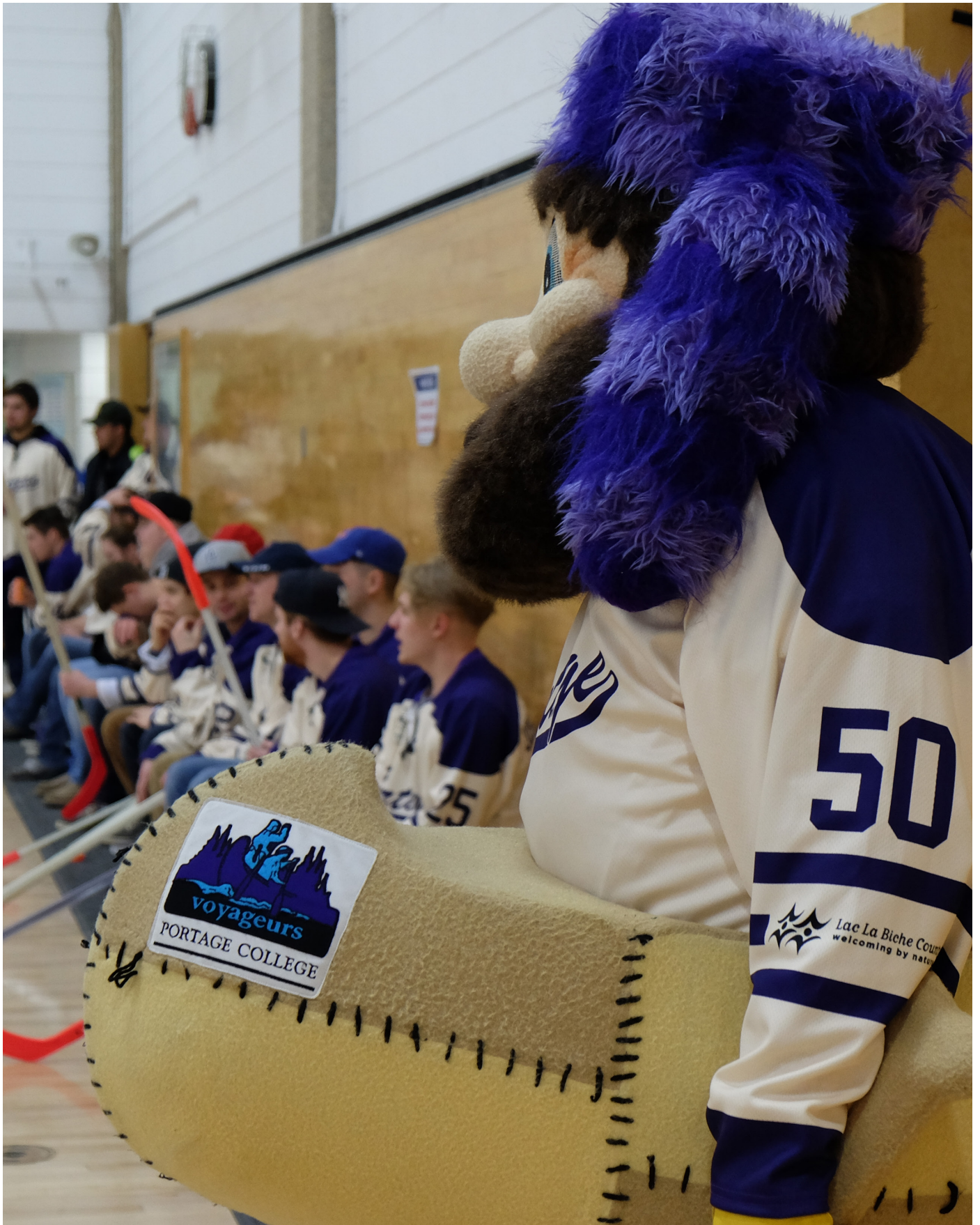
Hockey Parents Weekend, January 2018