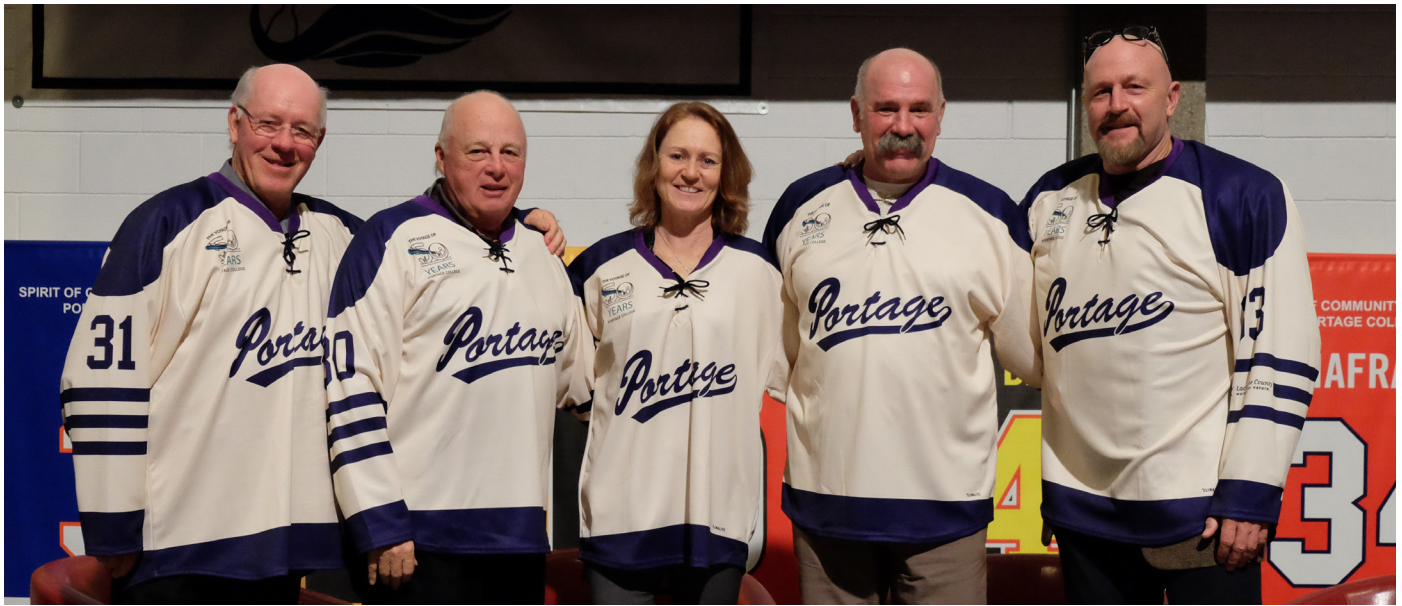
Five hockey legends attended the College's annual Spirit of Community Partnerships Dinner, April 1, 2018 From left to right: Billy Smith, Gerry Cheevers, Geraldine Heaney, Dave Babych and Al Iafrate

Portage College's top priority capital project is the expansion of our Cold Lake Campus. In order to meet the growing demand for programs and services and to address the increasing student numbers, the College is proposing to double the size of our current 29,062 square-foot facility. The $30 million expansion would not only create more space for students, who currently sit in a stairwell between classes, but also allow the College to expand our program offerings in a region where enrolment has increased substantially during the past five years. In May 2017, Advanced Education announced $1.08 million in funding for the College to complete a feasibility study for facility and program expansion in collaboration with the City of Cold Lake. The College has used the funding to develop architectural drawings of the proposed expansion project and to conduct a series of research reports examining regional demographics, student and employer demand, labour market analysis, military programming, partnership possibilities, competitor benchmarking and best practices in facility planning. The College expects to have a proposal before the provincial government by the end of the 2018-2019 academic year.