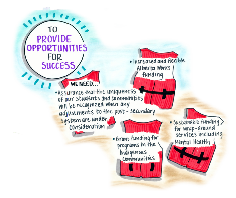
I Graphic recording by ViClarity Inc.

The College's number one capital project is an expansion of our Cold Lake Campus to create more flexible classroom, cultural and student spaces. The expansion of the College's Museum of Aboriginal People's Art and Artifacts is number two. The top information technology project is Enterprise Resource Planning renewal, which includes a Student Information System component.