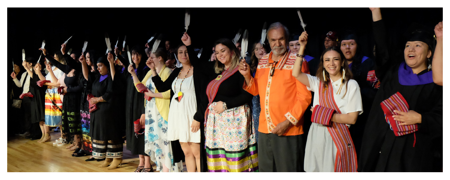
As part of Convocation, Portage graduates have the privilege in participating in an Honour Ceremony, held at the McGrane Theatre. Each graduate receives a symbolic eagle feather or Métis Sash as part of the ceremony, which has been a part of Convocation since 2003.

responded to the College's 2023 Employer Survey indicated that the pandemic had negatively impacted their business, with 18% indicating that the size of their workforce had decreased by 30% or more compared to pre-pandemic levels. However, 32% also indicated that they were having trouble finding interested and qualified applicants for job vacancies. This is consistent with labour market reports highlighting shortages in the education and health care sectors in Portage's service region. As noted in a July 2022 Labour Market Bulletin, "health care centres in the Lakeland region experienced service disruptions caused by staff shortages in July. Some acute care beds were temporarily unavailable in St. Paul and Lac La Biche, and the obstetrics unit in Lac La Biche has closed indefinitely."8 The College is also beginning to face the pressures of an increasingly job-abundant economy and is concerned about the loss of talent and the cost of turnover within the institution due to current salary restraints.